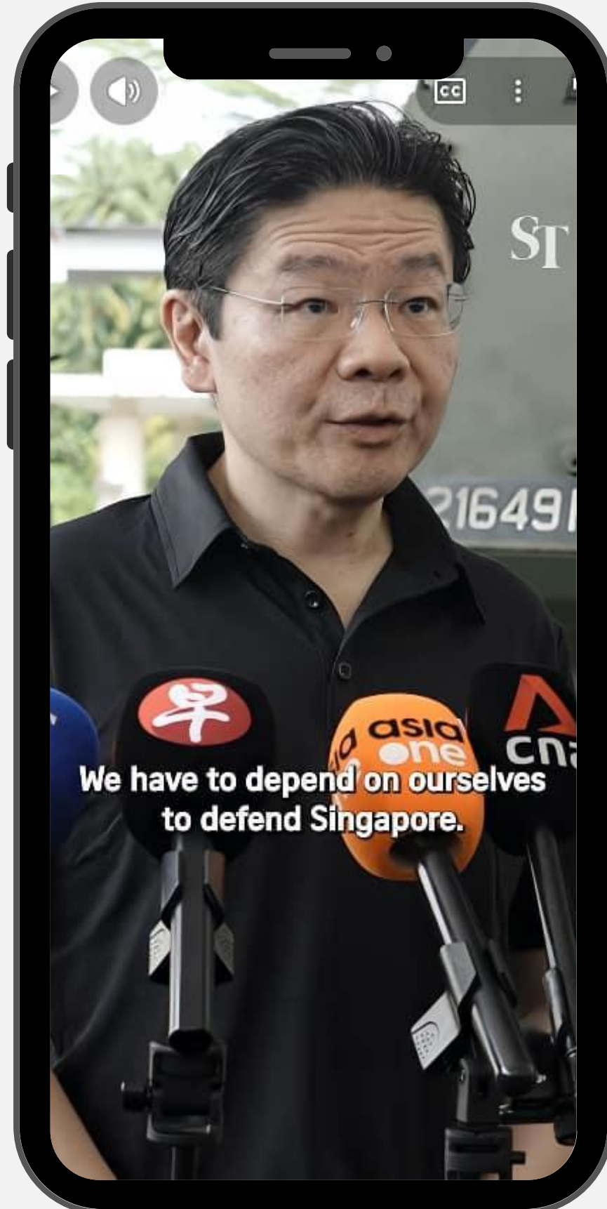
Link to video

“... in the time where we come under threat, no one is going to come to our rescue.