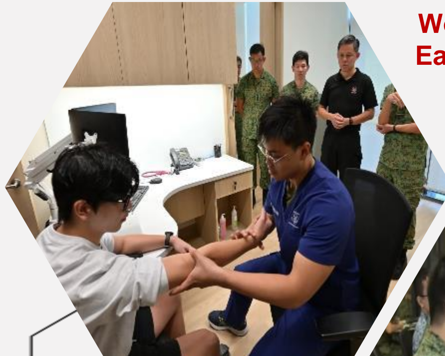
Medical Classification System Refresh