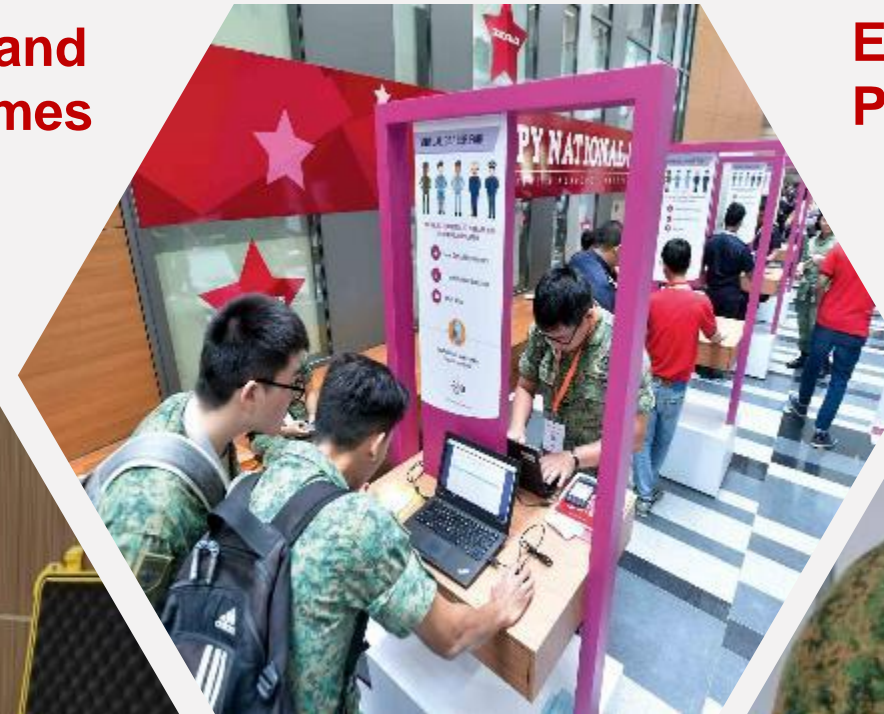
Job redesign across more than 2,000 roles