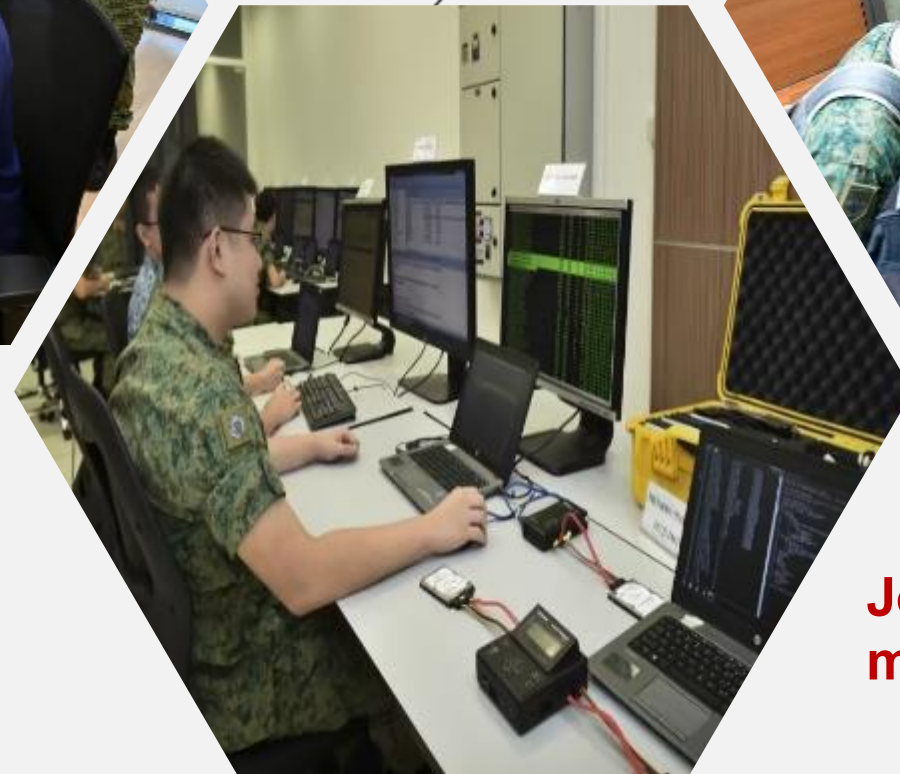
Job redesign across more than 2,000 roles