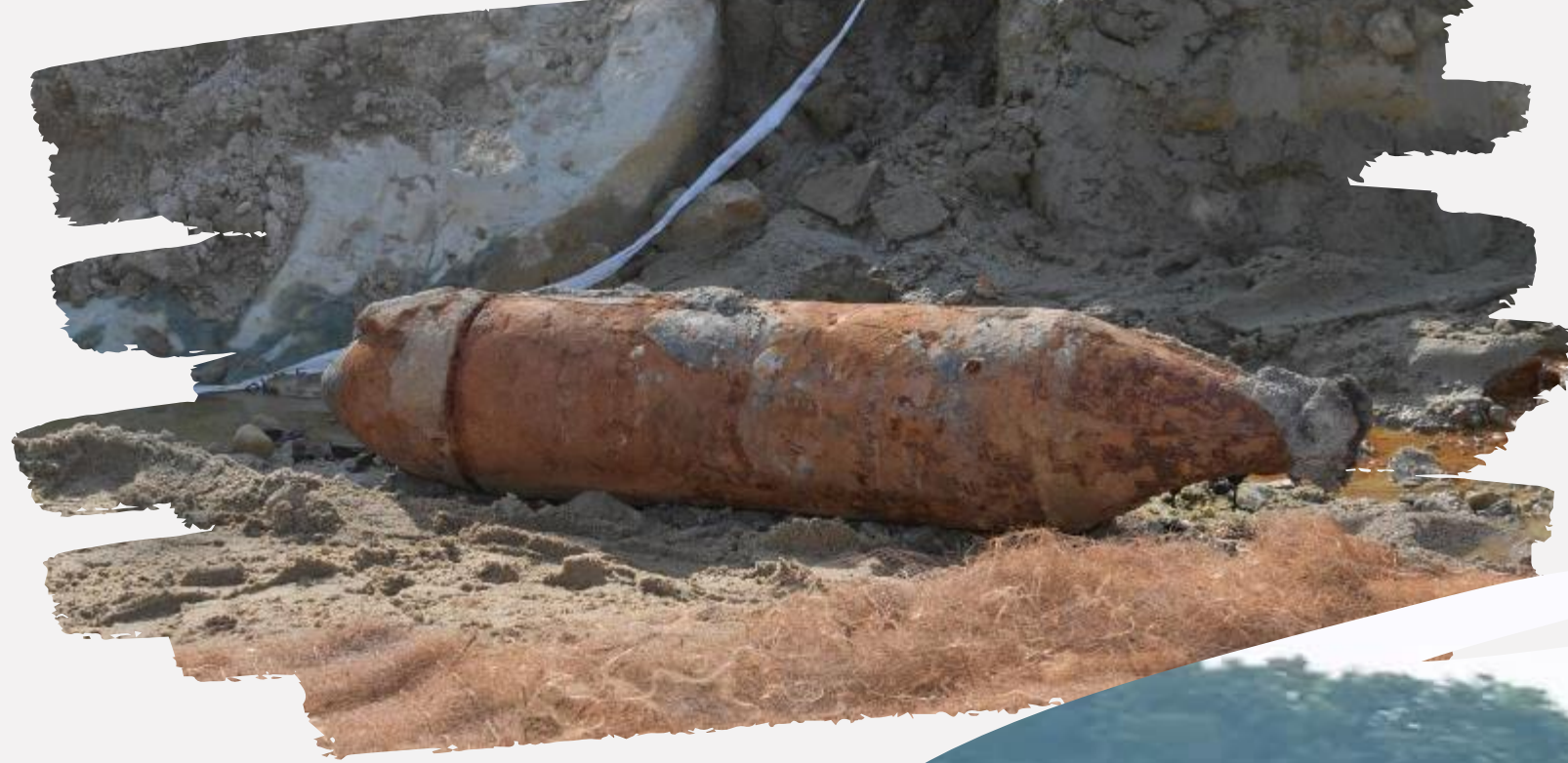
Disposal of World War II unexploded ordnance